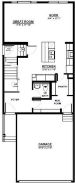
MAIN FLOOR 759 SQ.FT (9 FT. CEILINGS)